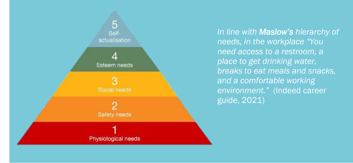
Table 4: Supporting evidence for Theme 4